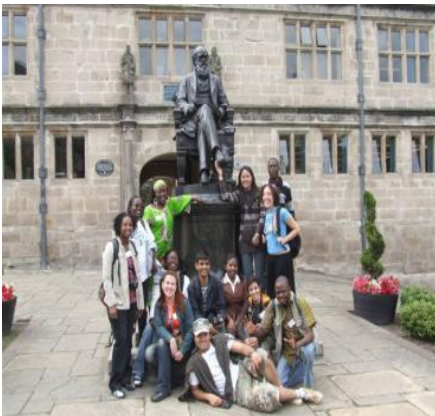
Darwin Scholars 2009

In 2014 we will be running the 7 th Darwin Scholarship Programme. We are now inviting applications for the 25 places that are available.