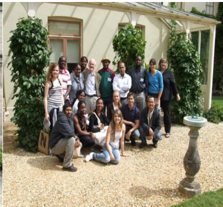
Darwin Scholars 2010